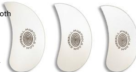
SS-P SS-P24 SS-P18 $21.40ea $38.55ea $25.70ea