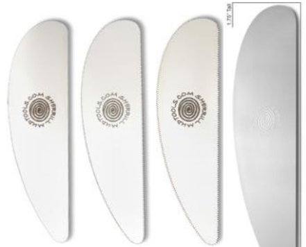
SS-L SS-L18 SS-L24 SSXL $25.70ea $38.55ea $47.15ea