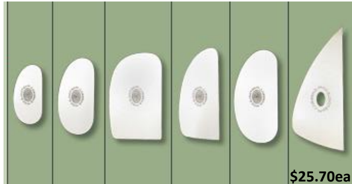
SS0 SS1 SS2 SS4 SS5 SSH015 $25.70ea