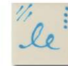
SG-410 Bright Blue