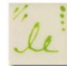
SG-409 Bright Green