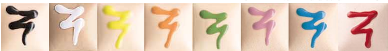
DFD254 Black Licorice DFD258 Pure White DFD265 French Straw DFD266 French Papaya DFD271 French Kiwi DFD274 Light Pink DFD275 Neon Blue DFD278 French Really Red