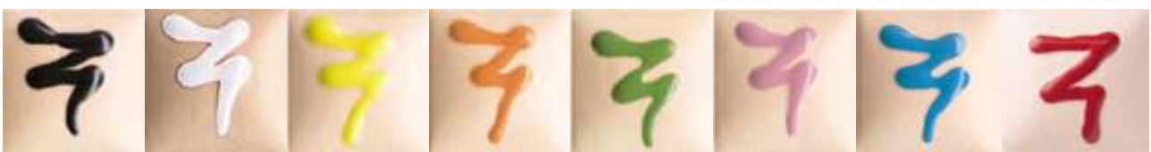
DFD254 Black Licorice DFD258 Pure White DFD265 French Straw DFD266 French Papaya DFD271 French Kiwi DFD274 Light Pink DFD275 Neon Blue DFD278 French Really Red